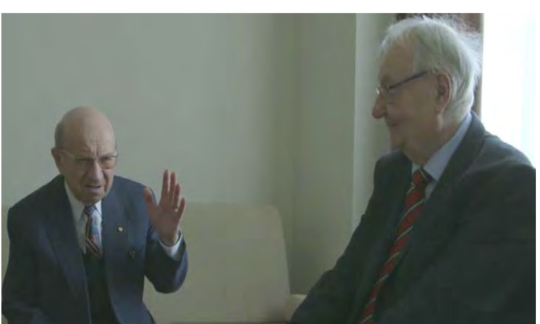
A JAK CIPLAMINA CI